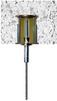
Illustrations are not to scale