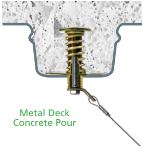
Metal Deck Concrete Pour