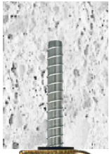
Illustrations are not to scale