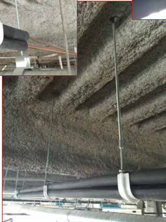
Fig. 110 MECHANICAL/PLUMBING APPLICATIONS